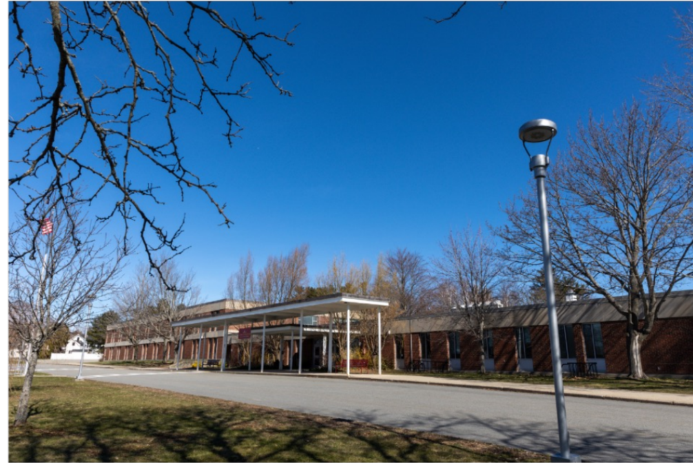
Edward G. Molin Upper Elementary Rupert A. Nock Middle