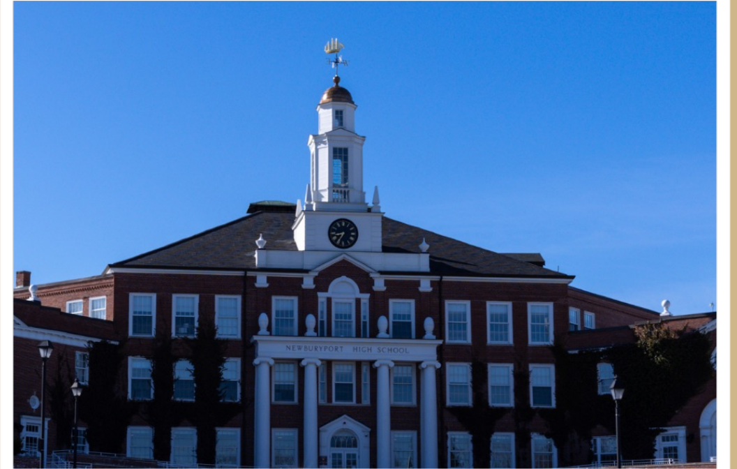
Newburyport High School