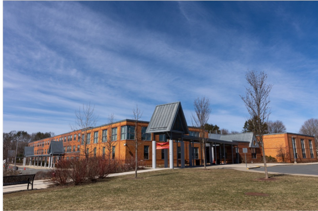
Francis T. Bresnahan Elementary